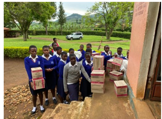
Boxes of ST's and mosquito nets arriving at the school

The Christmas campaign also provided sanitary towels for the whole year for both students and female teachers. We hope that by taking away this burden from the parents/guardians of providing these at the beginning of each term, we are showing our love for all the girls welfare. £10 per year is all it costs to provide the girls with this basic necessity. We will soon have to start collecting money for 2024 - would you like to help?