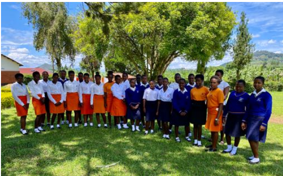
Mary Wood Trust sponsored girls - March 2023

Perhaps this sponsorship is something you might be interested in helping with? For £20 per month a girl is being given the chance for a secondary school education that she might not otherwise have. Regular termly school reports and letters from the girls create a closer connection with the girl. Please do get in touch if you feel this is something you might like to do.